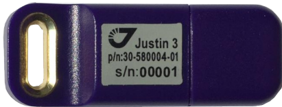
Safety key p/n 30-580004-01

When the JAVAD GNSS support team posts a response to your inquiry, an email containing this response is sent to the email address you have registered in your profile.