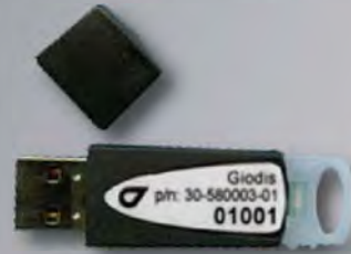
Sentinel SafeNet USB Hardware Key p/n 30-580003-01