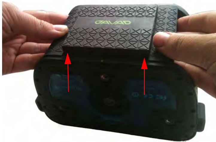
Figure 1. TRIUMPH V.S. Battery removing