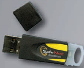
Sentinel SafeNet USB Hardware Key p/n 30-040403-01